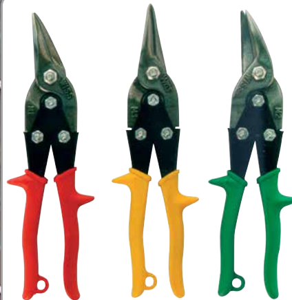
WISS AM-1R Left cut